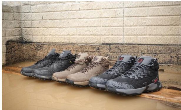
Waterproof Kitari DMX Work with DMX Moving Air Tech