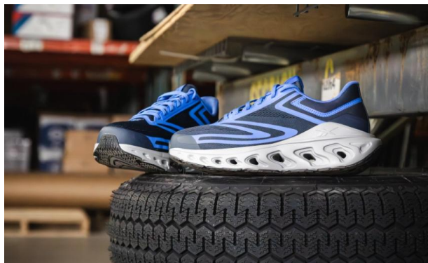
Fuel Flex Work with Fuel Flex Midsoles